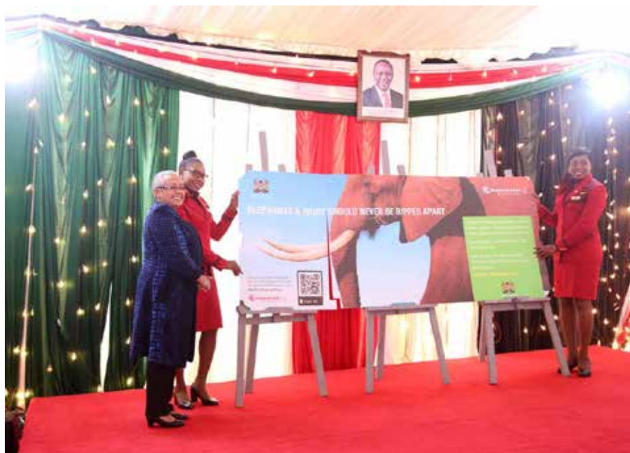
The First Lady of Kenya, H.E. Margaret Kenyatta launches Kenya's CITES CoP18 campaign dubbed #StopIvoryTrade.

In the run-up to and during the Conference of Parties proceedings in Geneva, the Kenyan Wildlife Service (KWS), Kenya Airways and Kenya Airports Authority (KAA) will jointly run a month-long campaign in support of Kenya's position against ivory trade. The three agencies have requested other conservation organisation to partner with them in the campaign, which will mainly run in Kenya's airports, to amplify the