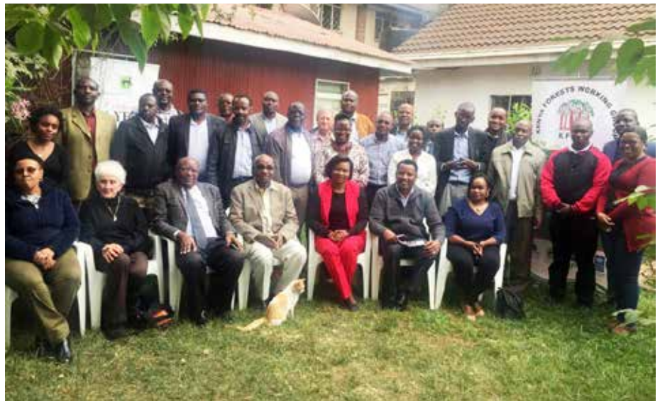
EAWLS hosts a Kenya Forest Working Group (KFWG) stakeholders meeting at the EAWLS offices.

Since the beginning of 2019, KFWG's Management Committee and the secretariat have been looking into ways of making the