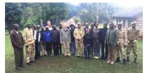
Officers of EAWLS-MEEP with trainees drawn from KWS and the local community.

Their security profile and exposure to poaching has been largely unassessed. EAWLS' Mount Elgon Elephant Project (MEEP) has kicked off with the training of community scouts on Spatial Monitoring and Reporting Tool (SMART) and Cyber Trackers as monitoring tools to help