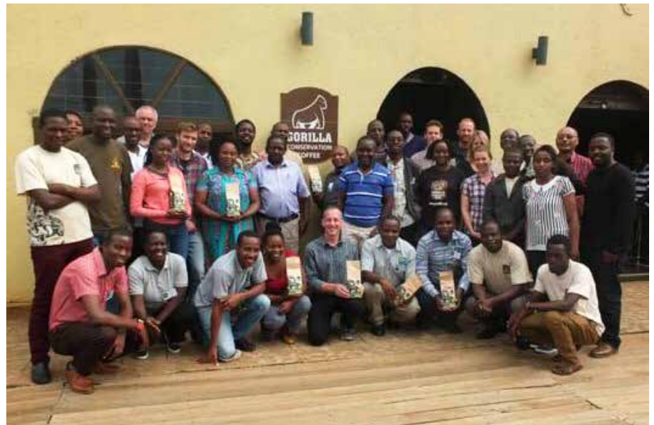
Delegates together with facilitators from Tropical Biology Association and CEPF pose for a group photo at Gorilla Conservation Coffee Café.

The CEPF programme is expected to close this year and therefore the workshop also sought to evaluate CEPF impact in the Eastern Afromontane region over the past seven years (since 2012) with a view to informing its new strategic focus and direction in the hotspot for the next phase. Projects implemented or being implemented by CEPF grantees vary from research, community livelihood and species and habitats conservation to Key Biodiversity