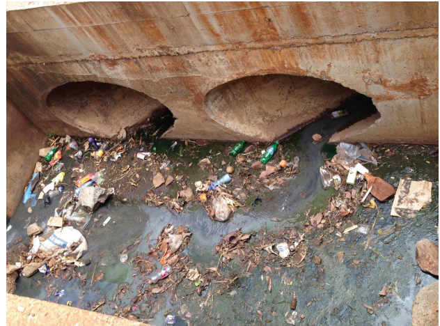
Waste water from Kikuyu town.

Unregulated water abstraction. The project findings revealed that there are over 40 permanent water pumps