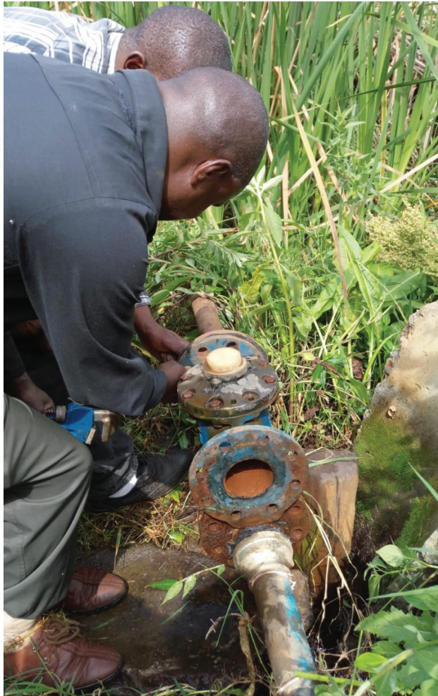
Water Resources Authority (WRA) officers disconnecting illegally installed water pumps at Ondiri Swamp.

built permanent structures and cultivated horticultural crops beyond the setback line. The eroded soil cause sedimentation of the swamp. Pollution is a major concern for the Swamp's long-term sustainability. The project findings revealed that surrounding greenhouse establishments and irrigation farms lack proper waste management practices and this has led to release of chemical effluents into the Swamp. Furthermore, the use of septic tanks in the surrounding residential homes, and the construction of highrise buildings near the Swamp has accelerated ground seepage of sewerage effluent into the Swamp. It was noted that the surrounding residential houses use the storm-water spillways of the Southern by-pass road to release urban effluents into the swamp causing its contamination. All these practices are in violation of rule 81 of the Water Resources Management (Water) Rules 2006 which prohibits discharge or application of any poisonous, toxic, noxious or obstructing matter, radioactive waste or other pollutants into a water body.