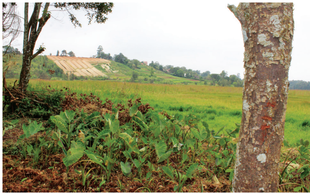
Arrow roots cultivation at the edge of Ondiri Swamp.

also attributed to low environmental literacy among the surrounding community and poor coordination among the stakeholders.