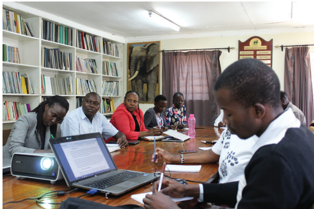
Stakeholder engagement meeting at EAWLS Boardroom.

with other key stakeholders such as WRA and NEMA among others to delineate the boundaries Ondiri swamp and gazette it to prevent it from further encroachment and over-exploitation of its resources.