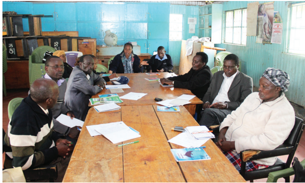
Community sensitization meeting at KERWA offices Ondiri.