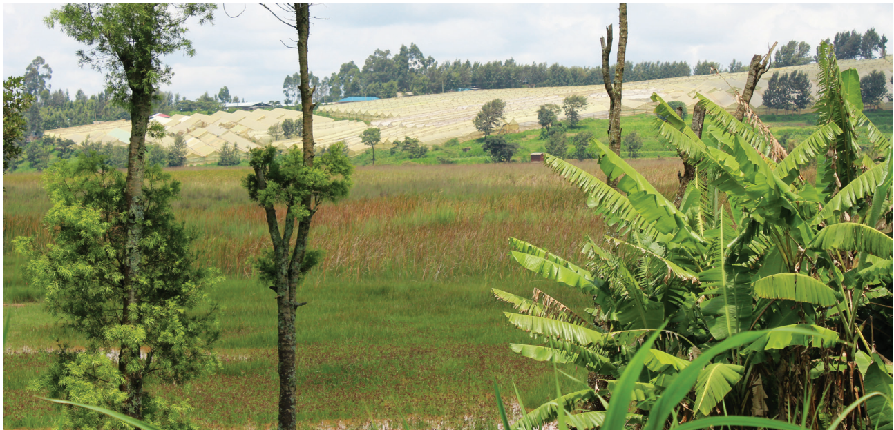
Scores of Greenhouses surrounding Ondiri Swamp.